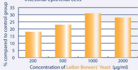
Figure 4: Reduction of adhesion of Salmonella Typhimurium to porcine IPEC-J2 cells